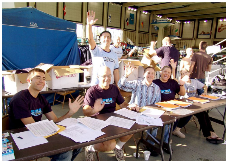
Long Beach Grunions hard at work at the registration table during the Short Course Meters Championships in December at Belmont Plaza.

All members are welcome to attend meetings. Please contact the SPMA Office for additional information.